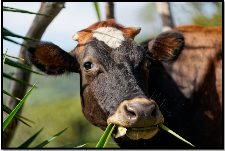
Pinta our mama cow

Beside the horses there are other farm animals that have to be cared for. After a briefing, the volunteers take on a task for which they are responsible during their stay. For example, the chickens and the dogs must be fed. Dogs must be washed, chicken stall cleaned. We have a milk cow and her calf, when it is milking period volunteers can also learn how to care for a family cow and milk as well as making: yogurt, butter, cheese etc. All the animals need attention and love.