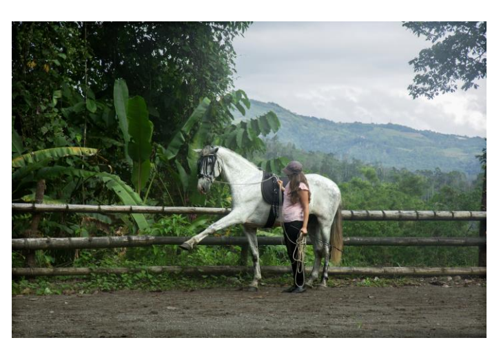
work our horses from the ground.

The lessons are held on the ground: on rope and liberty and riding: in a bitless halter or for advanced riders with a bit for better physical training. In the theory lessons we deepen the new learned information and put the philosophical frame around it. There is also a library with DVD's and books to which you have access. The lessons are held in English.